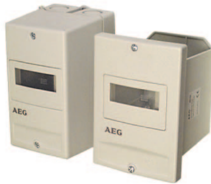
Catalog Number: MI55 Surface Mount