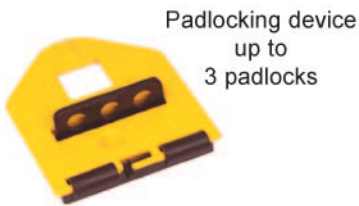
Padlocking device up to 3 padlocks