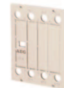
Contactor Terminal Marker