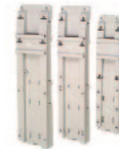
Combination Mounting Plates