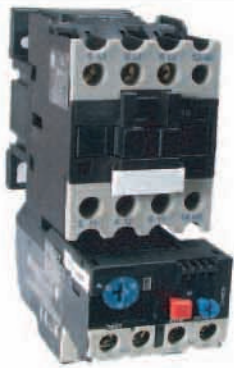
3 Pole + 1 N.O. Aux