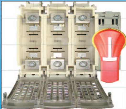
30Amp - 800A, CC, J Type Fusible Type