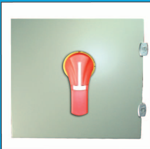
Enclosed Fusible & Non - Fusible NEMA, 1, 3R, 12, 4, 4X