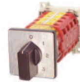
Base Mount Option*