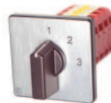
Front Panel Mount