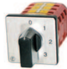
Front Panel Mount