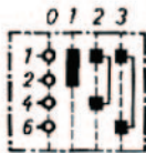
Typical 3 Step 0-1-2-3