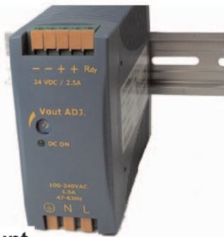
Din Rail Mount SWD