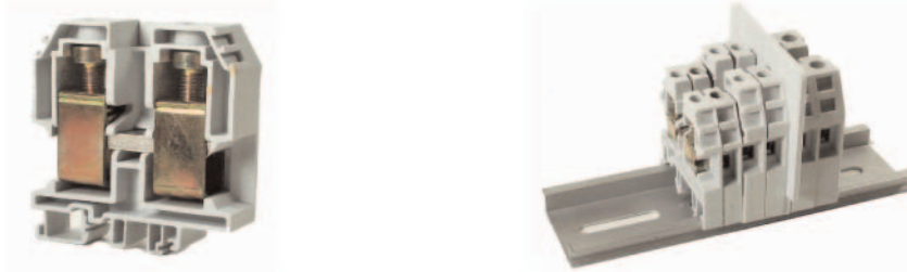
Series PL Positive Lock Terminal Blocks 600V, 230° F