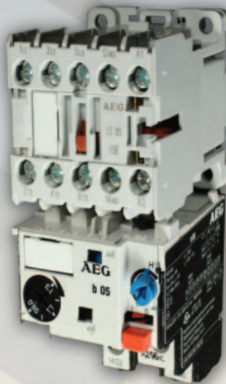
Type XLS05 MINI STARTER