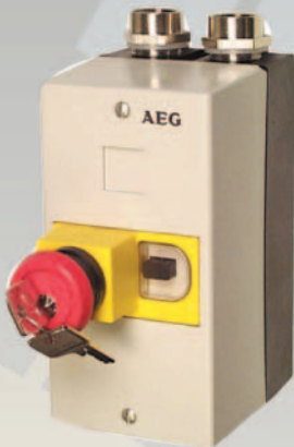
Type MBS25 S4 OUTDOOR DUST TIGHT ENCLOSURE