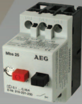
Type MBS25 OPEN STYLE CIRCUIT PROTECTOR