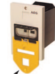
MBS 25-105 Lock Off Kit