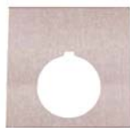
B30-BZ-AU-* (2.7/8" H x 2.7/8" W) List $4.10

Below engraved suffixes are considered "standard" engraved markings. Order Example: BZ-U-19 - BZ-U legend with "Auto" engraved $3.10 List