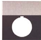
B30-BZ-AB-* (2.7/8" H x 2.7/8" W) List $5.50