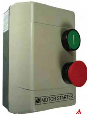
Momentary E-Stop Maintained if 1/4 Twist