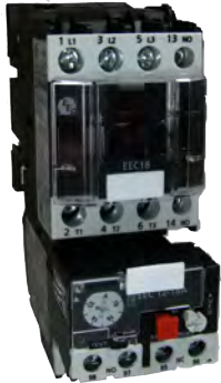
3 Pole + 1 N.O. Aux